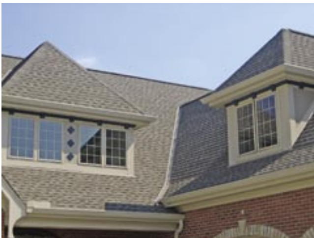
Window trim detail